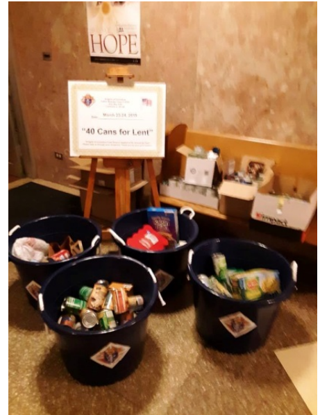
St. Pius X & Sacred Heart Food Collections